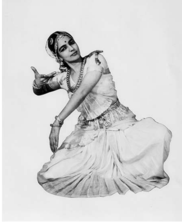
Figure 5: Rukmini Devi in the twentieth-century bharata natyam costume.

toire but that relied upon non-dance music or out-of-circulation choreography from the past. Likewise, practitioners commissioned music and created pieces outside conventional genres, choreographing ensemble works and evening-length pieces based on the bharata natyam movement vocabulary.