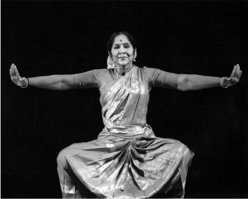
Figure 8: Balasaraswati performing an alarippu.

self even in abstract phases with no dramatic content; Rukmini Devi's interest in precision appears in expressive as well as rhythmic material.