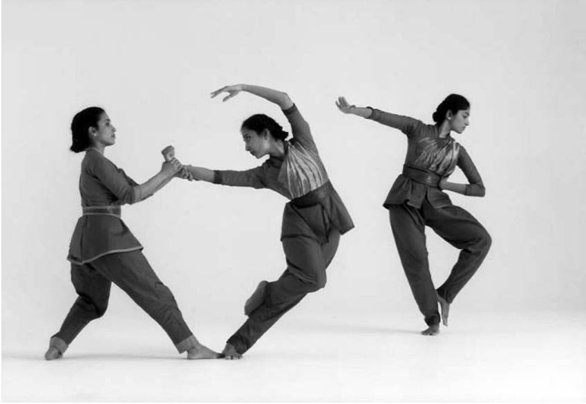
Figure 11: Shobana Jeyasingh Dance Company in Romance . . . with Footnotes .

also hybrid. She maintains that eighteenth- and nineteenth-century choreographers negotiated, in dance material, the aesthetic preferences of the various rulers of Thanjavur (Jeyasingh 1993: 7, personal correspondence 1999), and that others, through bharata natyam , grappled with the colonial contradictions of the early twentieth century. Based on this view of history, she suggests, practitioners can also incorporate the cultural hybridity of present-day British society into choreography.