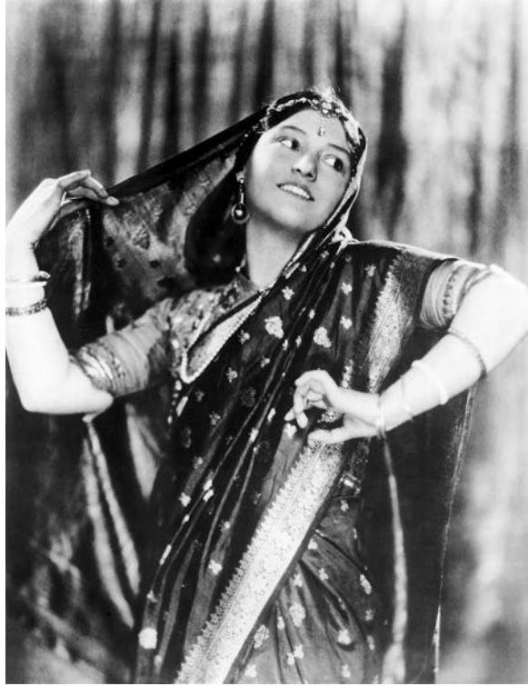
Figure 9: Ragini Devi.

From the 1910s to the 1940s, audiences outside of India and the South Asian diasporas attended concerts of interpretive work based on Indian themes and aesthetics, including those of La Meri, Uday Shankar, Ragini Devi, Ruth St. Denis, and Anna Pavlova. By 1935, Ragini Devi had turned to classical Indian dance. Uday Shankar returned to India, and subsequently, in the post-independence period, the popularity of his work waned, both in India and internationally. Also in 1935, Ram Gopal brought classical Indian dance to the international dance sphere. Gopal, whose concerts deployed the movement vocabulary and the repertoire of bharata natyam and other classical forms, began his international touring career during the early years of the bharata natyam revival. He achieved renown overseas with his contemporary stagings of classical choreography, selling out theaters in London's West End. These performances included margam items choreographed as duets and trios, with the pieces clustered thematically so that they formed an interlinked whole. Subsequently, Balasaraswati, embracing a more specific understanding of tradition, brought her margam -based solo concerts to prominent venues in the United States, Europe, and Asia from 1961 until the early 1980s. Thus, early-twentieth-century viewers, both in India and abroad, supported the performance of Indian-themed interpretive work, but the