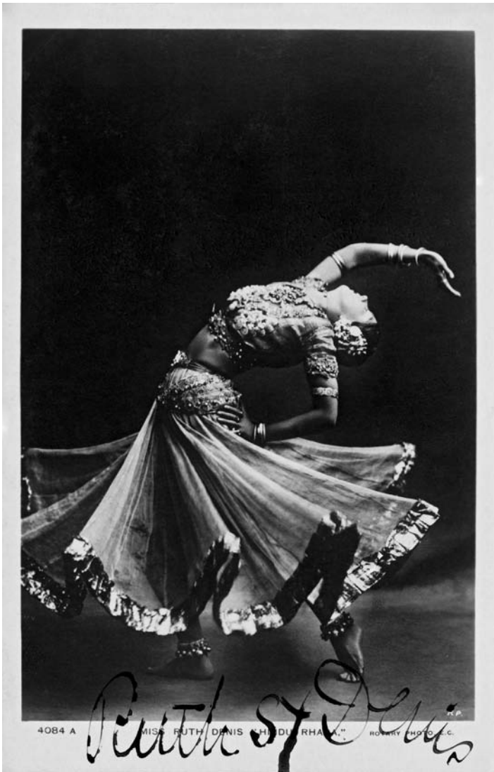
Figure 6: Ruth St. Denis in Radha.